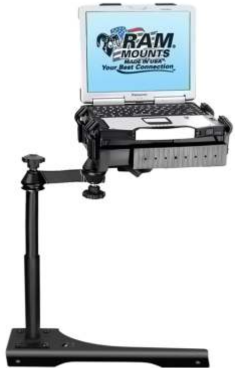
Complete Vehicle Mount RAM-VB-186-SW1

Installs in minutes with no drilling required Low profile keeps mount away from passenger leg space Lifetime warranty