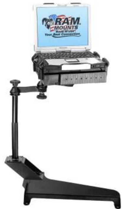
Shown with optional riser

National Products, Inc. Phone: 206-763-8361 Fax: 206-763-9615 Address: 1205 S Orr St Seattle, WA 98108 Website: www.ram-mount.com Email: staff@ram-mount.com