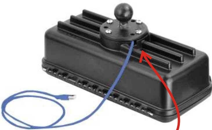
Run Electric Cord Then Fasten Base